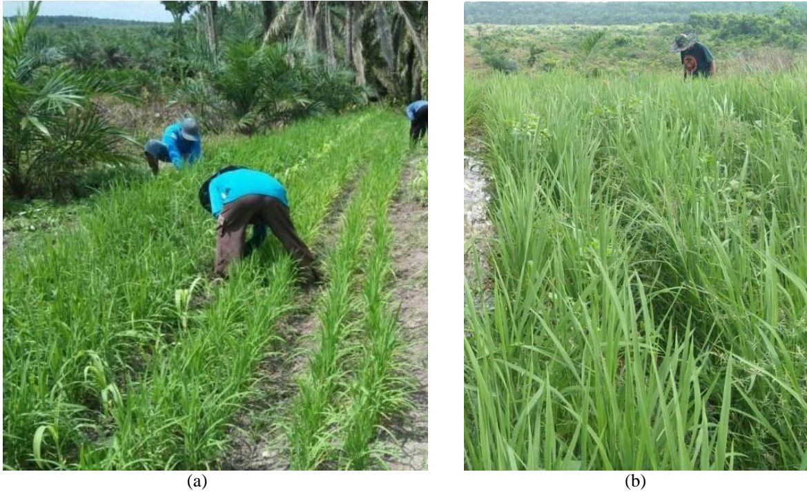
Figure 1. Growth of upland rice plants aged 30 DAS (a) and 45 DAS (b)