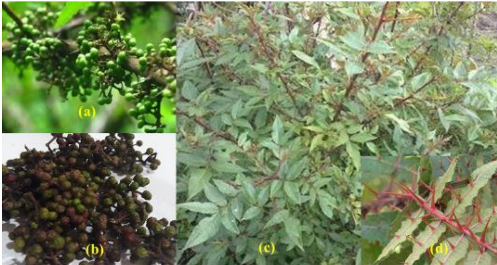
Figure 3. Morphological characters of andaliman: (a) young fruit; (b) ripe fruits; (c) crown and leaves; and (d) spines on the leaves