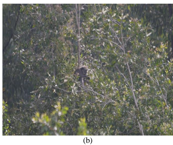
Figure 2. (a) Long-tailed macaque is taking a rest on Acacia crassicarpa ; (b) Long-tailed macaque is using Melaleuca cajuputi as food